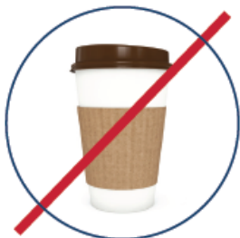
NO PAPER CUPS OR TO GO CONTAINERS