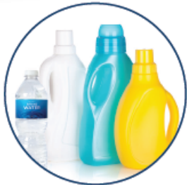
#1-#7 PLASTIC BOTTLES & TUBS

ALL OF THESE RECYCLABLES CAN GO INTO ONE BIN