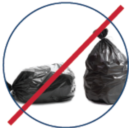
NO PLASTIC BAGS OR TRASH Do not put recyclables in plastic bags.