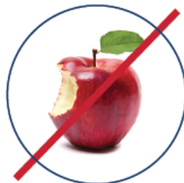
NO FOOD WASTE