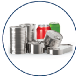
ALUMINUM & TIN CANS (PLEASE RINSE)