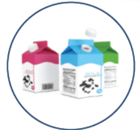
MILK & JUICE CARTONS