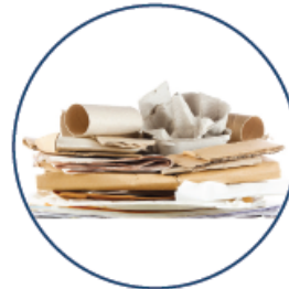
NEWSPAPER, PAPER, CARDBOARD & PAPERBOARD