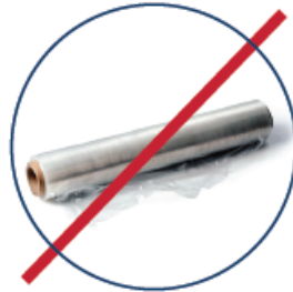
NO PLASTIC PACKAGING, WRAP OR FILM